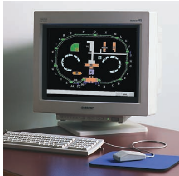
Perimeter Monitor (Operator Graphic Display)

The installer uses any PC to calibrate the MicroPoint cable sensor and assign zones. During calibration, the sensitivity